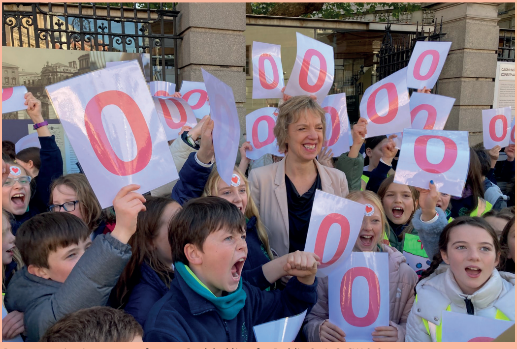
Demonstrating in support of a new Gaelcholáiste for Dublin 2, 4, 6, 6W & 8.

I have also been working with parents to address the serious shortage of creche places in our local area. Early Years Education should be a right – every child should be entitled to a childcare place.