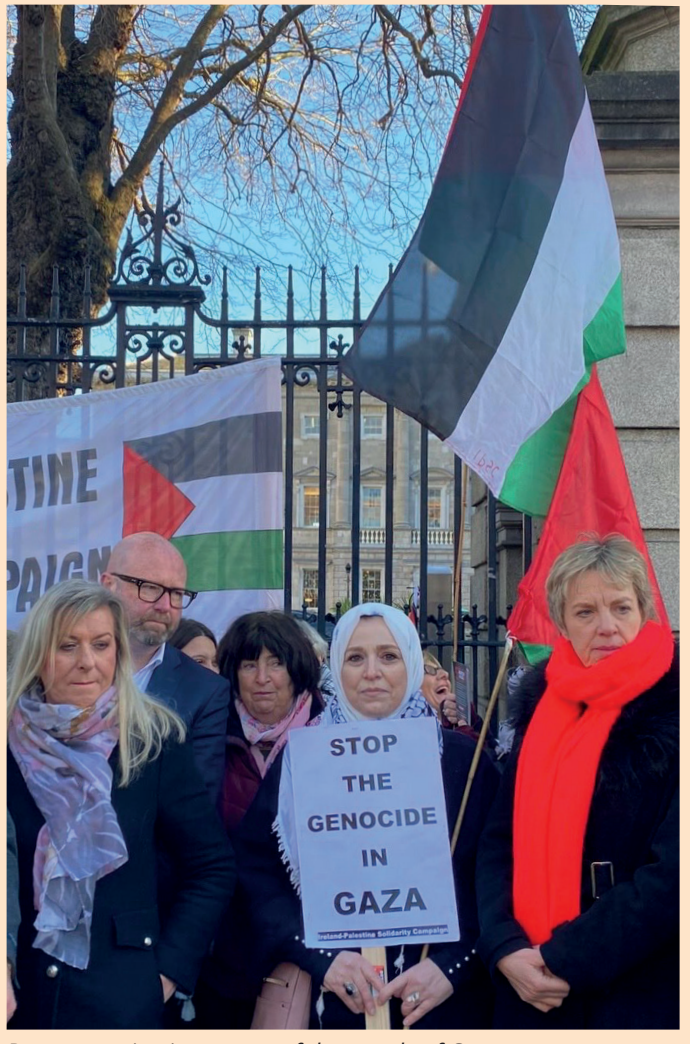
Demonstrating in support of the people of Gaza.

We in Labour have a strong track record of international solidarity with those campaigning for democracy and for human rights. Today, we see increasing numbers worldwide facing war, repression and brutality. We call for continued solidarity with the people of Ukraine as they endure Russia's brutal invasion and war.