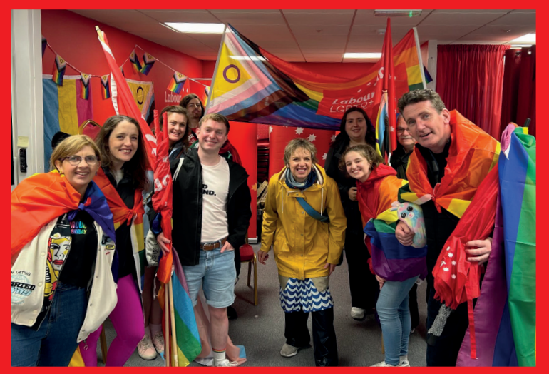
Getting ready to march for Pride in Dublin, June 2024.

We are out every week across the constituency, speaking with local residents about the issues that matter – and sharing our Labour vision of equality, solidarity and fairness.