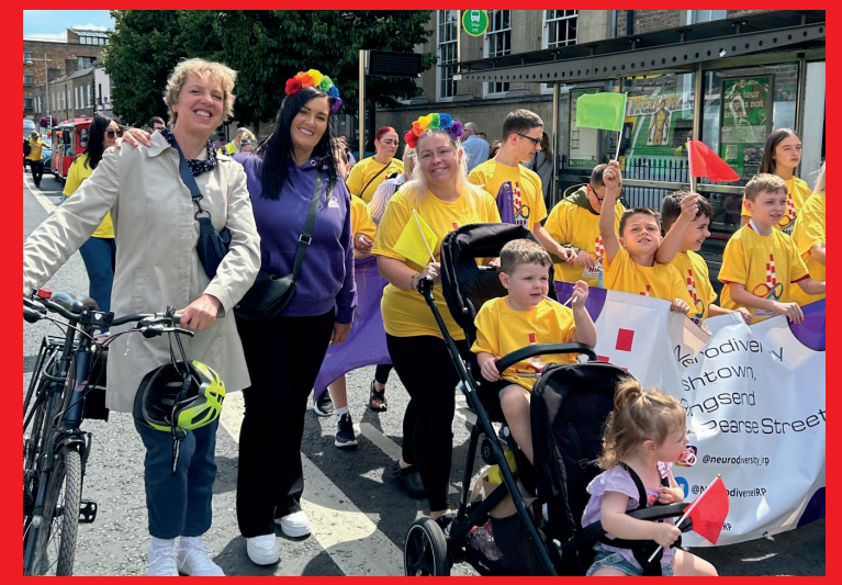
Taking part in the wonderful South Docks Festival parade, July 2024