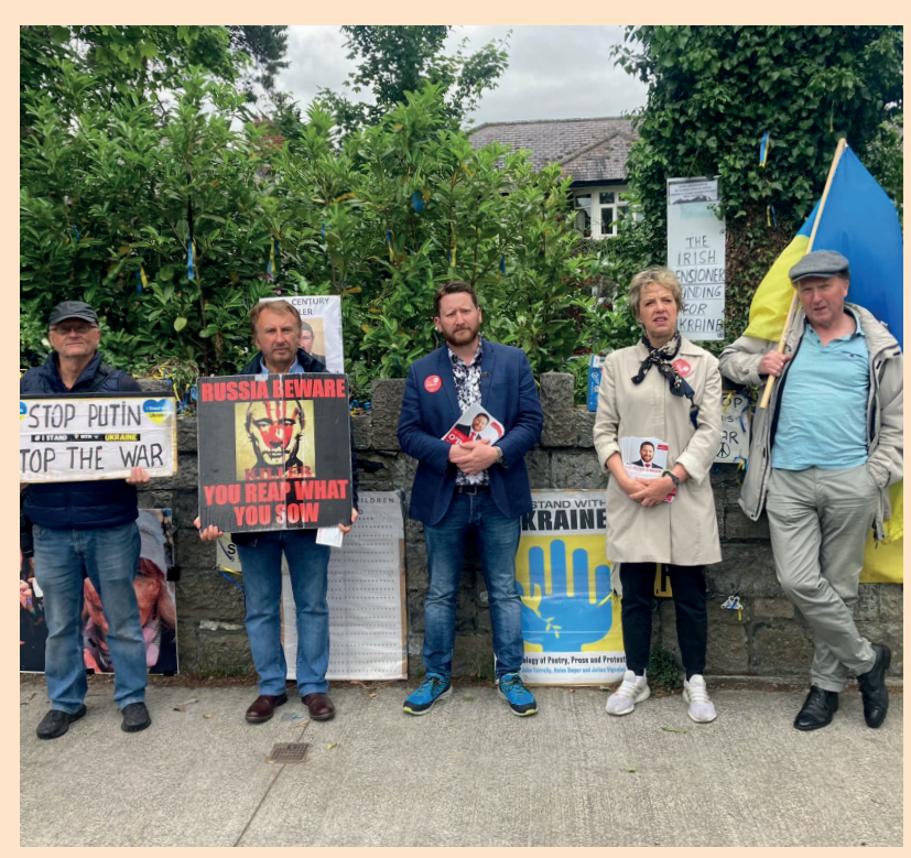
Outside the Russian Embassy in support of the people of Ukraine.

We stand firm with the people of Gaza under ongoing brutal bombardment by Israel. We welcome the recognition of Palestinian statehood by Ireland, but with mounting civilian casualties, we renew our call for a ceasefire, a return of hostages and an end to civilian casualties in Gaza, and for the development of a two state solution to bring about lasting peace in the Middle East.